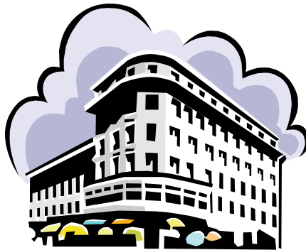
Jefferson Blvd. at Arlington Avenue