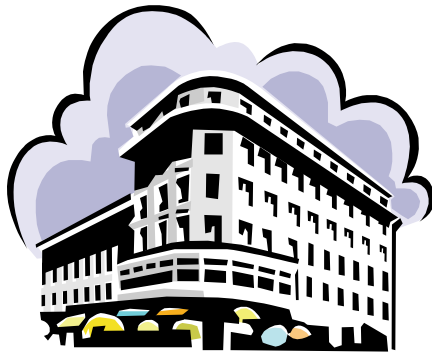
Arlington and Jefferson Blvd. The new mall in Jefferson Park

sometimes have to rest the complaining so we can stay healthy. The properties are now up for sale for commercial investors, but be-