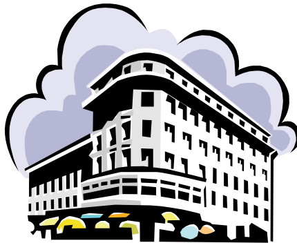
Arlington and Jefferson Blvd. The new mall in Jefferson Park

sometimes have to rest the complaining so we can stay healthy. The properties are now up for sale for commercial investors, but be-