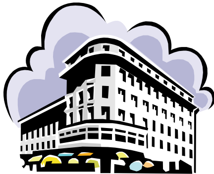
31st Street at Western Avenue

As soon as the place gets cleaned up the garbage is back again. Yes, we're still looking at the problem that exists on Western Avenue from 30th to 31st Street. The blight has been there for so many years that we sometimes have to rest the complaining so we can stay healthy. The properties are now up for sale for commercial investors, but be-