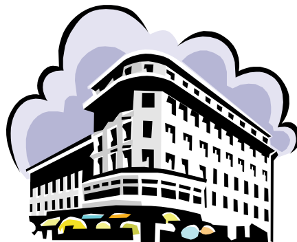
Jefferson and Arlington Avenue Our new Plaza

It's going to take a very strong sustained community effort to improve what's happening on the corner of Western Ave. and 31 Street. As they say so often, the wheels of government turn slowly. Patience is a virtue. Now we have Mercy Housing.